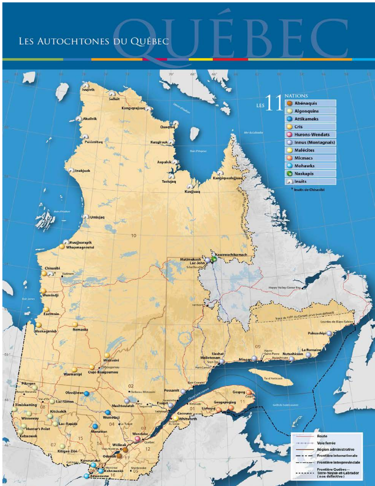
Map 2: The Aboriginal communities of Québec